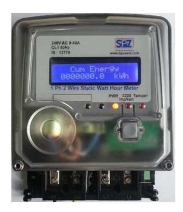
240VAC, (10-60)A, Class 1.0S (IS:13779)

Sai PowerrZerve 29/3B , Rajalakshmi Nagar, 1<sup>st</sup> Main Road, Velachery Bye Pass, Chennai – 600 042.